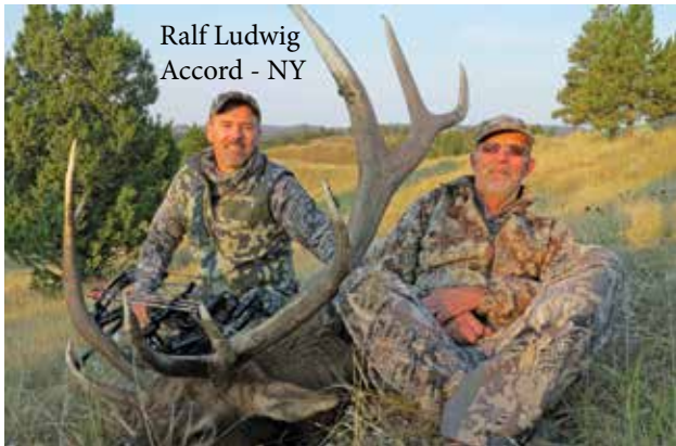
Ralf Ludwig Accord - NY

Non-resident licensing in Montana requires timely applications for proper species and areas. We recommend the e-licensing system. All booked hunters will receive detailed information on licensing.